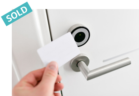
HOTEL KEYCARDS $30,000

Back by popular demand, the Meet Your Match Game is returning to Los Angeles! All attendees will receive a button that includes a number and your organization's logo. They'll search for other attendees with a matching number to win prizes such as a NACAC Conference 2025 Full Conference Package. This sponsorship includes logo recognition on conference materials, signage, social media, and in marketing/attendee emails.