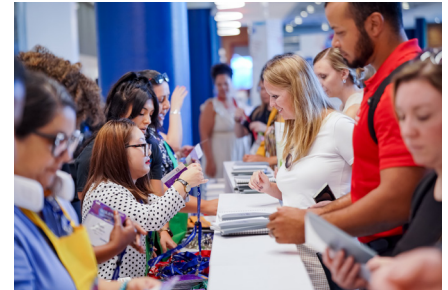
REGISTRATION AREA $50,000

Have your organization's brand on the hotel room key cards of over 6,000 attendees as the exclusive sponsor. All attendees staying at one of the officially contracted hotels will receive a key card upon arrival featuring your organization's logo. This sponsorship also includes logo recognition on conference materials, signage, social media, and in marketing/attendee emails.