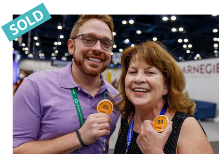
MEET YOUR MATCH GAME $30,000

For more information, contact: nacac@theYGSgroup.com