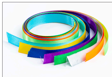
RIBBON BAR $25,000

Badges and the accompanying lanyard with your organization's logo will be distributed at registration and attendees are required to wear them for all NACAC Conference 2024 programming. This sponsorship includes logo recognition on conference materials, signage, social media, and in marketing/attendee emails.