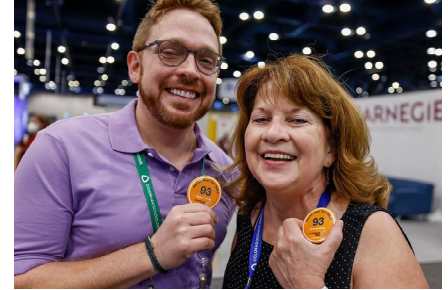
MEET YOUR MATCH GAME $35,000 (Exclusive)

Engage with attendees from the moment they begin their registration for Columbus. Your brand will gain early exposure with your logo featured in attendee confirmation emails, enhancing visibility well before the event begins. Your presence will extend to the registration area, a high-traffic, centrally located hub in the convention center where your logo will be prominently displayed on signage and self-serve kiosks. Every attendee will pass through this area to check in and receive their official badge.