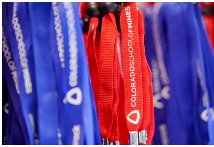
LANYARDS $35,000 (Exclusive)

Have your organization's brand on the hotel room key cards as the exclusive sponsor. Attendees will receive a key card upon arrival featuring your organization's logo. This sponsorship also includes logo recognition on conference materials, signage, social media, and in marketing/attendee emails.