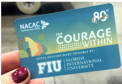
HOTEL KEYCARDS $35,000 (Exclusive)

Back by popular demand, the Meet Your Match Game is coming to Columbus! All attendees will receive a button that includes a number and your organization's logo. They'll search for other attendees with a matching number to win prizes such as a NACAC Conference 2026 Full Conference Package. This sponsorship includes logo recognition on conference materials, signage, social media, and in marketing/attendee emails.