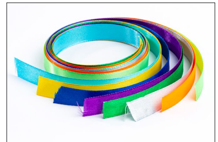
RIBBON BAR $25,000 (Exclusive)

Badges and the accompanying lanyard with your organization's logo will be distributed at registration and attendees are required to wear them for all NACAC Conference 2025 programming. This sponsorship includes logo recognition on conference materials, signage, social media, and in marketing/attendee emails.