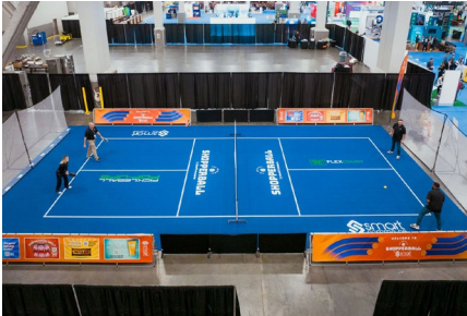
PICKLEBALL COURT $50,000 (Exclusive)

For more information, contact: nacac@theYGGroup.com