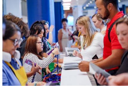
REGISTRATION $50,000 (Exclusive)

Elevate your brand with this NEW Pickleball Court Sponsorship opportunity! Connect your brand to one of the fastest-growing sports in the country! Your logo will be prominently displayed on the court, customized paddles, and barriers around the court providing high visibility to both players and spectators during the conference. The court will be in the exhibit hall and open during all exhibit hall hours.