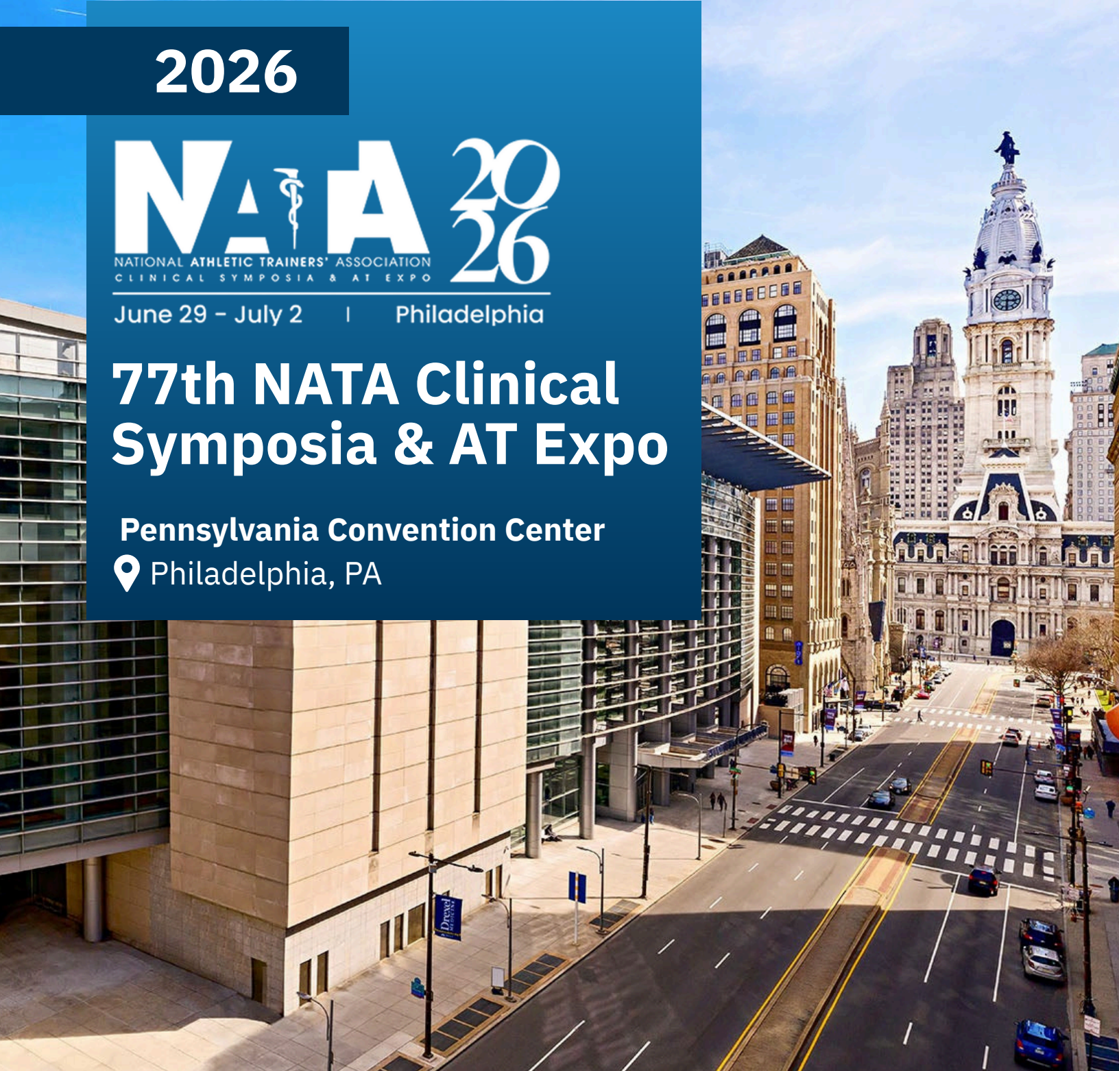
Exhibit & Sponsorship Prospectus